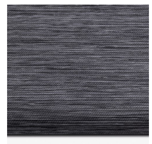
65008 Pure Chocolate