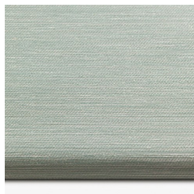
65010 Misty Blue